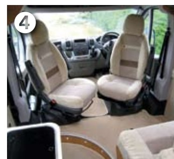
HALF-DINETTE LAYOUT The half-dinette up front is identical to that found in the existing Autocruise Pace. LED lights stud the step down from lounge to kitchen