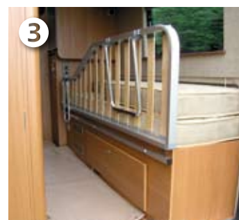
ACCESS AND STORAGE The hinged longitudinal rear bed allows access to the rear doors, and creates space to store bikes in transit. The sofa becomes a storage 'shelf'