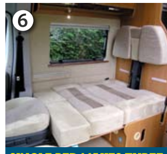
SINGLE BED MAKES THREE The half-dinette and swivel cab seat converts into a third sleeping berth, which is 0.9m (5'8") at its widest, and 0.54m (1'9") at its foot