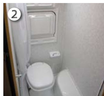
NARROW WASHROOM The tip-up basin is a neat space saver in the compact corner washroom. The mould for the wheelarch prevents the toilet swivelling, though