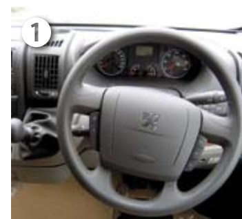
CLEVER BOXER CABIN All Altos have silver metallic paintwork and colour-coded bumpers. The £1175 Comfort Pack buys cab air con, cruise control and reverse sensors

The longitudinal rear bed is an innovation that brings a much-loved coachbuilt layout to a van conversion without enormous compromise. This is a real feat of ergonomic engineering from Autocruise