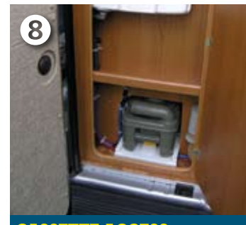
CASSETTE ACCESS Access to the toilet cassette is through the rear doors, reducing the need for cut-outs in the 'van's steel walls and giving a tidier overall look

*FOR INSURANCE QUOTES TERMS AND CONDITIONS SEE PAGE 146