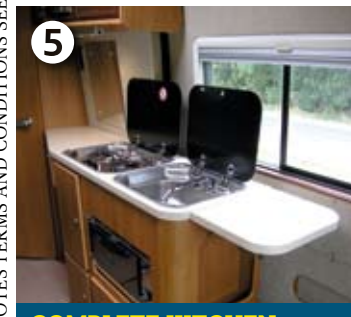
COMPLETE KITCHEN The kitchen galley is surprisingly spacious. The spark ignition two-burner hob and grill has dedicated downlighters overhead

Autocruise Motorhomes, Dunswell Road, Cottingham, East Yorkshire HU16 4JX Web www.autocruise.co.uk Tel 01482 847 332