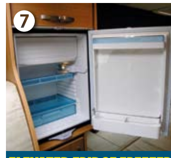
ELEVATED FRIDGE FREEZER The 72-litre Waeco compressor fridge/freezer sits above the wardrobe so it doesn't eat into the bed's overall length