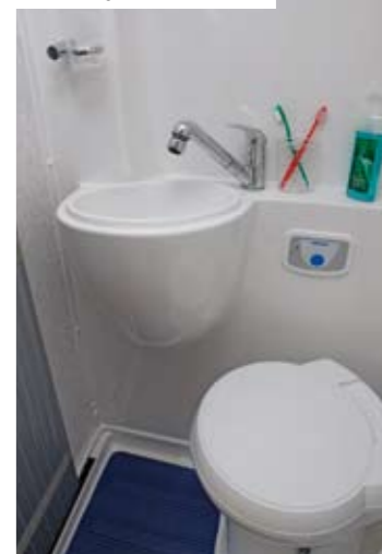
The toilet and washbasin are easily accessible

When you try to cram two seating areas into a van conversion, there have to be some areas of compromise and it's really the kitchen and washroom that suffer. The Accent's washroom manages to fit in a washbasin, swivelling cassette toilet and room for a shower, but it's fairly confined. There's not much room between the toilet and the wall to create shower space and a curtain on two sides shields the toilet and toilet paper from getting wet, but you will splash the other two walls when showering. The wall on the left as you enter is lined with vinyl wallpaper, while the wall behind the washbasin is white plastic. Considering it's going to get splashed with water, perhaps it would have been better if the whole washroom had white plastic walling, rather than having some sections with wallpaper? If you love to have a long morning shower, this cramped shower area might be a bit too limited, but for a short splash over and wipe-down it will be fine. The toilet and washbasin are certainly easy enough to access.