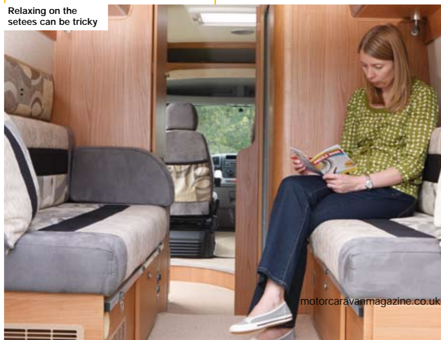
Relaxing on the settees can be tricky

For a really relaxing read or an afternoon nap, the swivelled cab seats are probably going to be the choice for most owners, since you can recline them and can also benefit from the headrests. Both the forward-facing seats at the front and the inward-facing settees at the rear are quite upright in comparison, so less easy to get comfortable on if you want to sprawl. One of the clever aspects of the front lounge is that the floor is also raised here, to match the higher floor in the cab, so the person sitting on the swivelled passenger seat doesn't find their legs dangling in the air. There's then just a step down to access the centre of the vehicle, then another step up at the rear to access the seating area here.