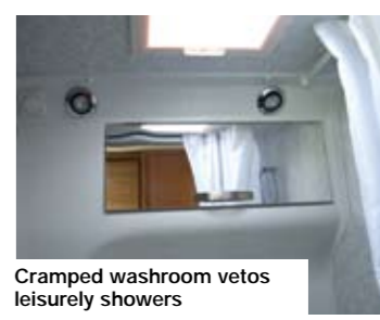
Cramped washroom vetos leisurely showers