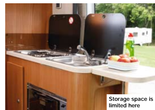
Storage space is limited here