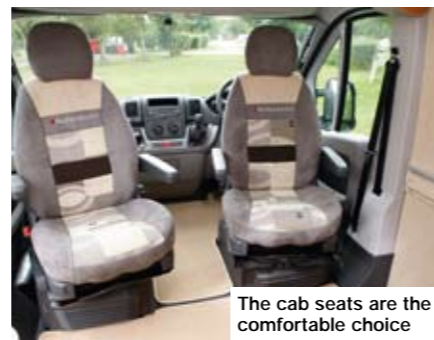
The cab seats are the comfortable choice

If you turn the rear bedroom into a seating area during the day, then you have a choice of two areas for dining. At the rear, an island-leg table can be used so that four can dine in relative comfort, albeit shoulder-to-shoulder. Meanwhile, at the front, a wall-mounted table fits between the swivelled passenger's cab seat and the forward-facing seats, but it's a bit of a reach to the table for anyone sitting in the swivelled passenger's cab seat. Cleverly, this table can also be mounted outside the van, with one end of it clipping on to a rail on the back of the kitchen units, once the sliding door is opened. The kitchen is in the centre of the van, between the front and rear seating areas, so whichever you choose to use, you'll be able to serve up food fairly easily. Perhaps you could even have a 'his 'n hers' evening with your friends - with the ladies playing cards at one end of the van, while the men drink beer and discuss motorhome reversing problems at the other end!