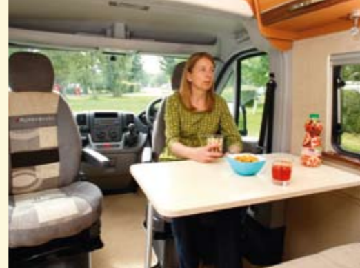
There are numerous dining options with the Accent