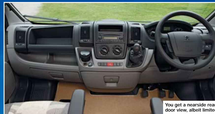
You get a nearside rear door view, albeit limited

Autocruise has already been offering this type of layout in the form of the Pace van conversion, but for the 2010 model year it has introduced a new version with the Accent. What's the difference? Instead of having a space at the rear, fairly useless when the bed is not in use, the Accent has a pair of inward-facing settees at the back, which make-up into a transverse double bed. This extra level of versatility means you can leave this area made up as a double bed, or use it as a second lounge area during the day, using these twin settees.