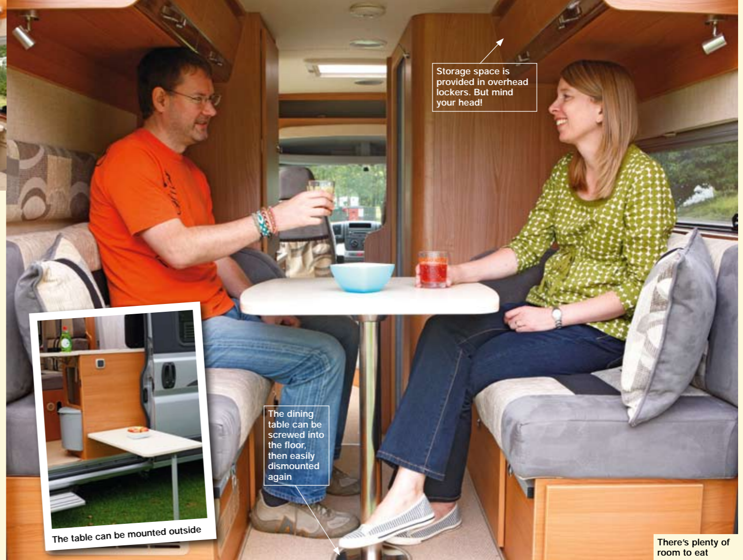
Storage space is provided in overhead lockers. But mind your head!